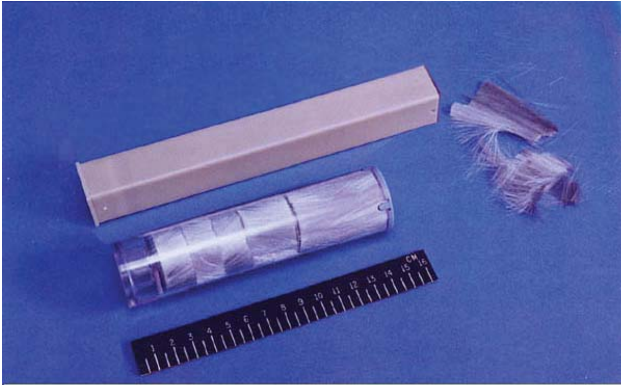
Figure 1. Radio frequency chaff cartridges (Air Force version RR-188/AL, top; Navy version RR-144/AL, bottom) and chaff fibers (right). Fibers of different lengths can be seen in the Navy operational version (clear cylinder). These lengths correspond to the frequency modes of the radar spectrum. In training, however, cartridges containing only 1.8 cm fibers are used (not shown).